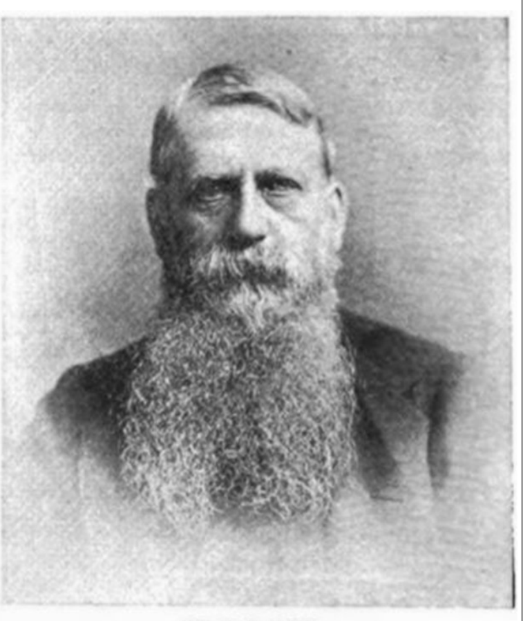
SIR H. B. LOCH, Chief Commissioner at the Cape.

Loch was patron of the 1888 Melbourne Centennial International Exhibition and officially performed the opening, for which he was presented a medal [NU 16453]. The following year he went on leave to England, and was appointed High Commissioner for South Africa and Governor of Cape Colony. He returned