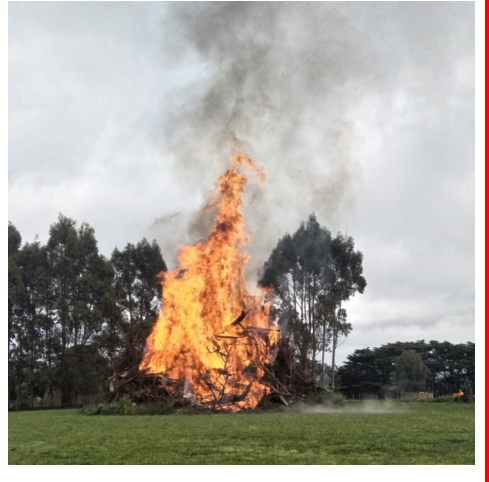
Recently fire crews from Darnum-Ellinbank, Trida and Yarragon assisted in a burn off at Seaview.

For more information about preparing your property, go to cfa.vic.gov.au/prepare .